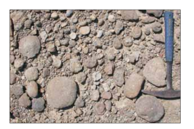
Bathonian: Jumara Coral Bed, Kachchh