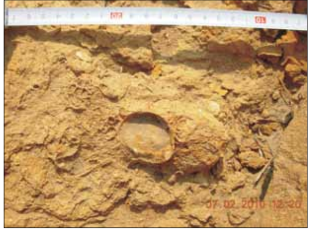
Oysters encrusted on the upper surface of the rudstone (hardground surface) in Nala-section, 1.5 km west of Kuldhar village; Oxfordian