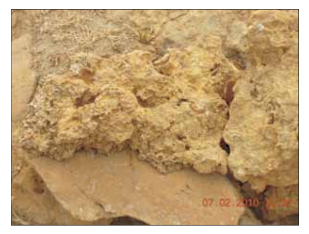
Close up view of oyster reef building on a hardground surface indicating sediment starve condition exposed in Nala-section 1.5 km west of Kuldhar village; Oxfordian