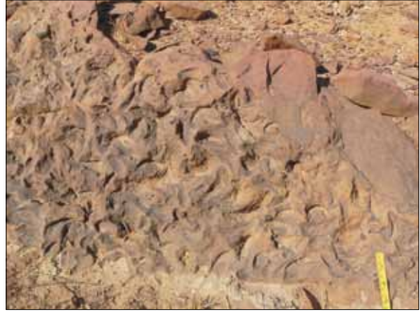
A close up view of upper surface of sandstone showing Fuersichnus (non-marine), north of Badasar ridge; Late Tithonian