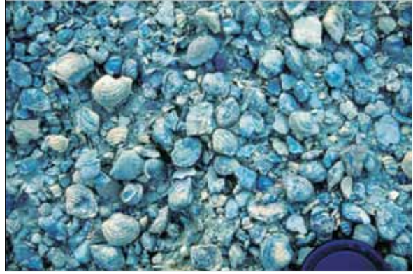
Bajocian: Low diversity association of brackish water bivalves of lagoonal origin