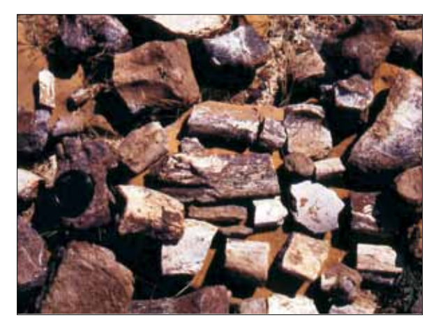
Early Jurassic: Dinosaur bones from the Bajocian sediments North of Khadir Island, Kachchh (Camarosauromorpha)