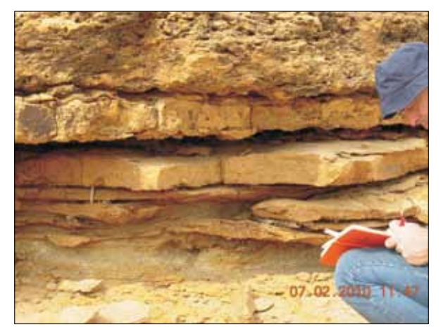
Close up view of Nala-section, 1.5 km west of Kuldhar village showing sharp change in lithology. The top bed is bioturbated; Oxfordian