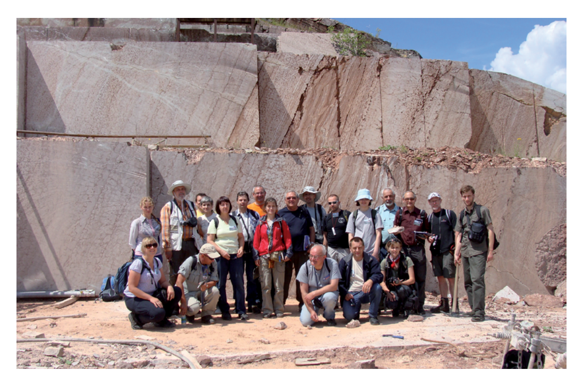
Fig. 1. Participants of the Jurassic X Meeting at Veliky Kamenets quarry, Transcarpathian Ukaraine; at the background the limestones (mostly ammonitico-rosso deposits) exploited and polished as the so-called "Neresnitsa marbles"

The Polish Working Group of the Jurassic System was founded on 13th May 1999 in Warszawa during initiative meeting which gathered 31 persons representing various geological centers in Poland. During the 70th Annual Meeting of the Polish Geological Society in Międzyzdroje on 9th June 1999, the Group was officially established as a separate section affiliated at the Society. Initially, organization of the International Congress on the Jurassic System in Poland was one of the main goals of the Group. The Congress was held in Kraków in 2006 and was arranged in cooperation with all geological departments and institutes in Poland and with the help of Slovak geologists. The