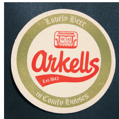
Fig. 3. Souvenir beer mat from the Arkell Brewery