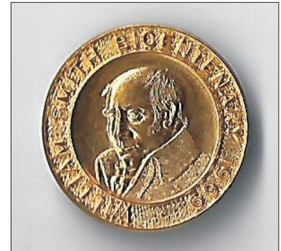
Fig. 1. William Smith Bicentenary medal

In total there were 117 overseas visitors from 24 countries and about 60 British specialists participating in various ways in lectures, discussions and excursions.