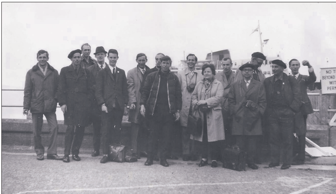
Fig. 8. The Western Scotland party waiting at Armadale in southernmost Skye for the ferry to Mallaig to join the train for the return to London, 23 rd April 1969.